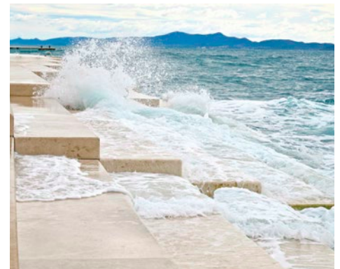
Sea organ, Zadar