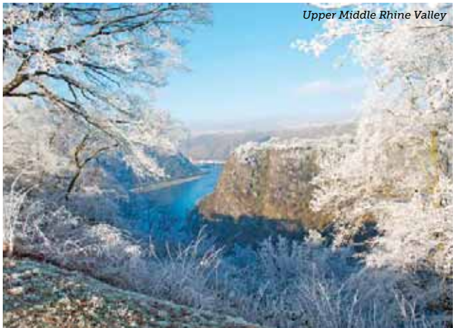
Upper Middle Rhine Valley