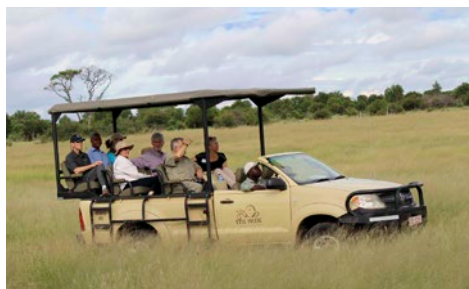
Top: Lion | Above: Safari