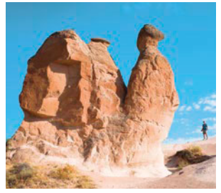
Devrent Valley, Cappadocia