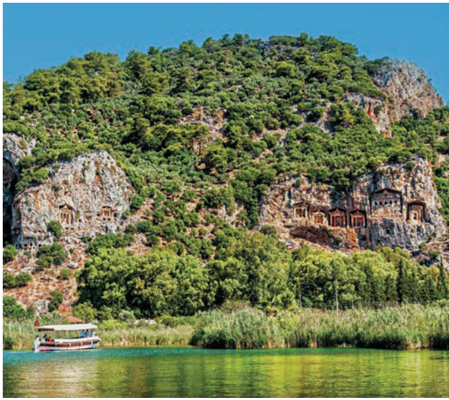
Lycian Tombs of Kaunos