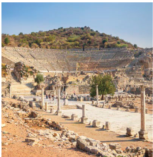
Left: Library of Celsus, Ephesus | Above: Grand Theater, Ephesus

Avanos Pottery Workshop. Watch skilled potters shape pieces out of the local red clay and learn about their techniques and designs.