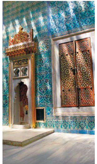
Topkapi Palace, Istanbul

Knowledgeable Lecturers deepen your appreciation for the region and its history, culture and current events.