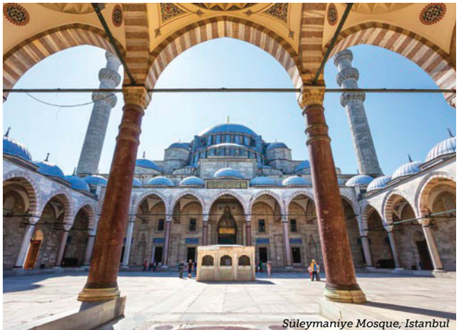
Süleymaniye Mosque, Istanbul