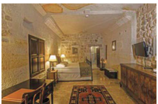
Yunak Evleri Cave Hotel | Ürgüp (Cappadocia)