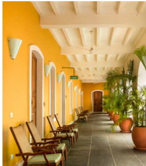
Palais de Mahé, Pondicherry