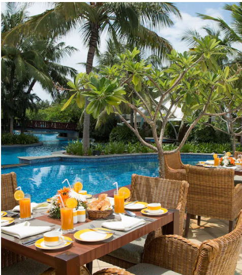
Radisson Blue Resort Temple Bay, Mahabalipuram

Worldwide Quest has been awarded the World Travel and Tourism Council's #SafeTravels Stamp for adopting health and hygiene global standardized protocols. Learn more.