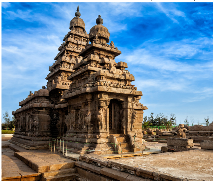
Shore Temple, Mahabalipuram