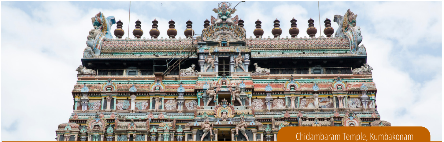
Chidambaram Temple, Kumbakonam