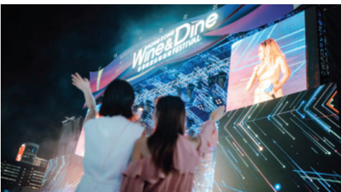
Hong Kong Wine & Dine Festival

Day at leisure, travellers may be out exploring using their city pass. This afternoon, transfer with the group to Central Harbour Event space for Wine & Dine event with VIP entrance. After the festival, travellers are free to go explore the city or go back to the hotel on their own