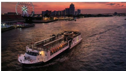
Saffron Dinner Cruise

Transportation: Cathay Pacific or similar