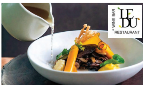
Le Du Michelin-starred restaurant

Enjoy breakfast at the hotel before being picked up for your Oasis Spa experience. Golden Sensation package (3 hrs): Start with a sandalwood body scrub, followed by a Thai massage. Finish with an aromatherapy massage using gold flakes in essential oils, leaving you glowing. After the spa, return to the hotel and relax for the afternoon. In the evening, you'll be picked up for a group dinner at Michelin-starred restaurant Le Du.