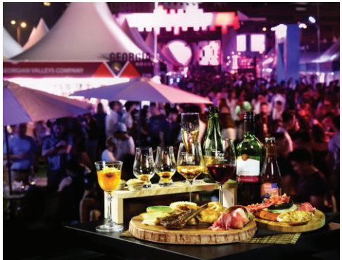
Hong Kong Wine & Dine Festival