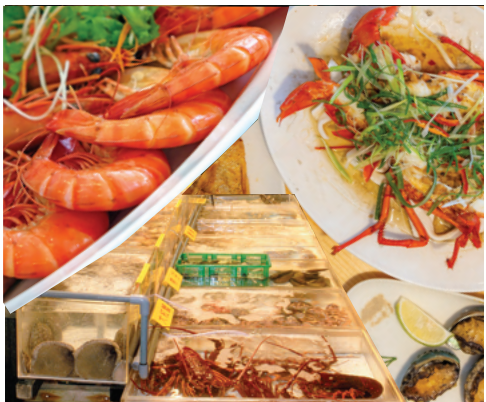
Lei Yue Mun Seafood Market

This evening, you will be transferred to Lei Yue Mun for a special seafood dinner.