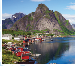
NORWAY AND LAPLAND MAY 8 – 23, 2026