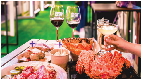
Wine and Dine, Hong Kong

Day at leisure, travellers may be out exploring using their city pass. This afternoon, transfer with the group to Central Harbour Event space for Wine & Dine event with VIP entrance. After the festival, travellers are free to go explore the city or go back to the hotel on own.