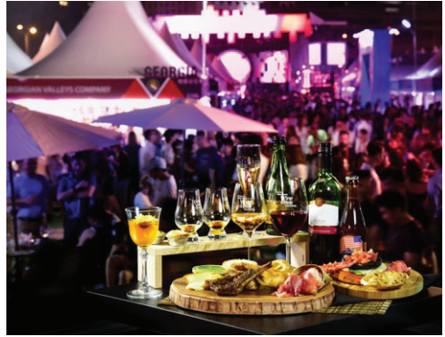
Wine and Dine, Hong Kong