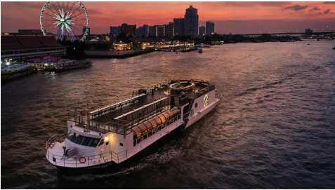
Saffron Dinner Cruise

Transportation: Cathay Pacific or similar