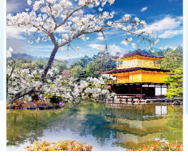
SOUTH KOREA AND JAPAN MAY 9 - 27, 2025