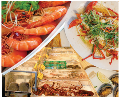
Lei Yue Mun Seafood Market

This evening, you will be transferred to Lei Yue Mun for a special seafood dinner.