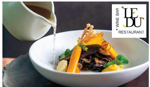
Le Du Michelin-starred restaurant

Enjoy breakfast at the hotel before being picked up for your Oasis Spa experience. Golden Sensation package (3 hrs): Start with a sandalwood body scrub, followed by a Thai massage. Finish with an aromatherapy massage using gold flakes in essential oils, leaving you glowing. After the spa, return to the hotel and relax for the afternoon. In the evening, you'll be picked up for a group dinner at Michelin-starred restaurant Le Du.