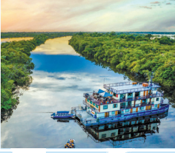
BRAZILIAN AMAZON ADVENTURE APR 25 – MAY 10, 2026