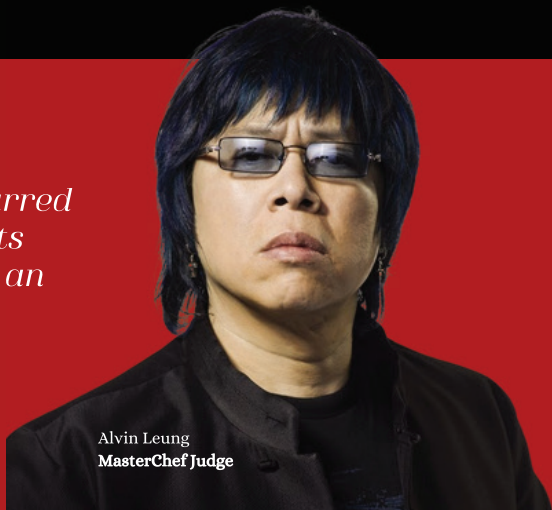
Alvin Leung MasterChef Judge

Bo Innovation, a two Michelin-starred restaurant, creatively reinterprets traditional Chinese flavours with an artistic twist.