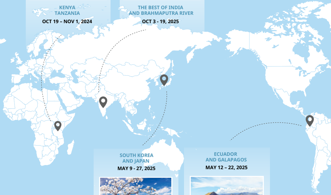
SOUTH KOREA AND JAPAN MAY 9 - 27, 2025