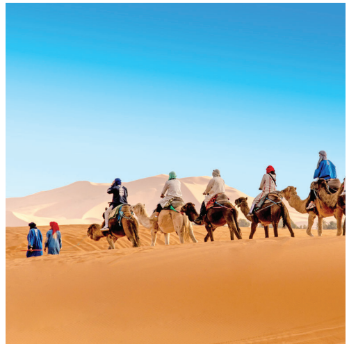
Camel ride, Merzouga

Begin your day early with a spectacular sunrise over the Sahara dunes during a camel ride. Following breakfast, we set out for Khamlia, a charming desert village, where you can savor a cup of tea in a traditional home. The journey continues to Tissirdmine, where we'll enjoy lunch amidst palm trees before returning to our Kasbah. The day includes a visit to Memphis and mines, concluding with dinner at the hotel.