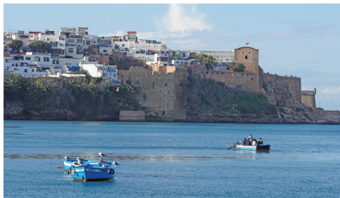
View of the harbour, Rabat

Our next destination, Rabat, the capital of Morocco, situated on the banks of the Bouregreg River and the Atlantic Ocean. Afterward, we proceed back to Casablanca and enjoy our farewell dinner at Ricks Café, a romantic eatery inspired by the cafe in the 1942 film "Casablanca".