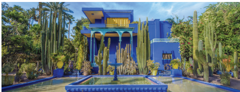
Majorelle Gardens, Marrakech

Marrakech's Jardin Majorelle stands as one of Morocco's highly frequented attractions. Over a span of forty years, the French painter Jacques Majorelle (1886-1962) poured his passion and dedication into crafting this captivating garden in the heart of the "Ochre City."