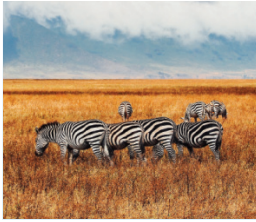
KENYA TANZANIA OCT 19 - NOV 1, 2024