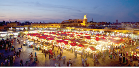
Djemaa el-Fna, Marrakech