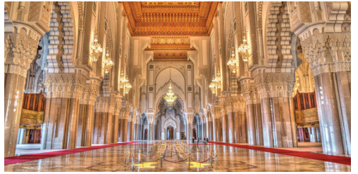
Hassan II Mosque, Casablanca