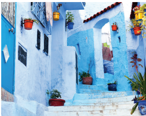
Traditional moroccan architectural, Chefchaouen

Our journey leads us south to Meknes through the ancient Roman ruins of Volubilis. Known as the 'Versailles of Morocco,' Meknes unveils its old medina and the impressive Bab el Mansour Gate. Savor lunch at a local restaurant.