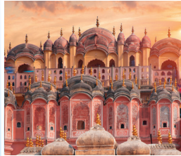
THE BEST OF INDIA AND BRAHMAPUTRA RIVER OCT 3 - 19, 2025