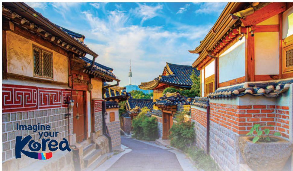
Bukchon Hanok Village, Seoul