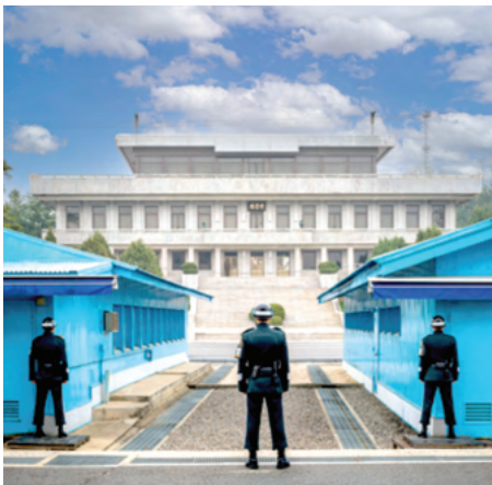
Joint Security Area in DMZ

Journey to the Korean Demilitarized Zone (DMZ), the stark border between North and South Korea. Visit key sites including Imjingak Park, the symbolic Freedom Bridge, and the clandestine Third Infiltration Tunnel. Gain unique perspectives of North Korea from the Dora Observatory and explore Dorasan Station, the northernmost railway station in South Korea. After exploring these poignant and historic sites, return to the hotel for a leisurely evening or further personal exploration.