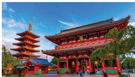
Asakusa Kannon Temple, Tokyo

Start the day visiting Tokyo's serene Meiji Jingu Shrine, steeped in tranquility and tradition. Dive into the culinary world with a sushi-making session, then wander through the lively stalls of Tsukiji Outer Market, famous for its fresh fare and rich history. Continue to the venerable Asakusa Kannon Temple, a beacon of the Edo period, and meander along the Nakamise Shopping Arcade, where a variety of traditional garments, handicrafts, and snacks invite exploration.