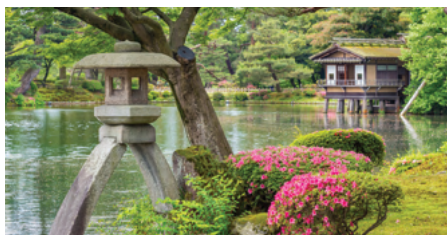
Kenrokuen Garden, Kanazawa

Set off to Takayama by coach, stopping en route in Shirakawago to explore the Wada family's former residence, a distinctive gassho-style house with a steep thatched roof from the mid-Edo period. Continue to Gokayama, where you'll witness the traditional craft of creating Washi, Japanese paper. Afterward, proceed to your hotel in Takayama, where you can indulge in a Japanese hot spring experience.