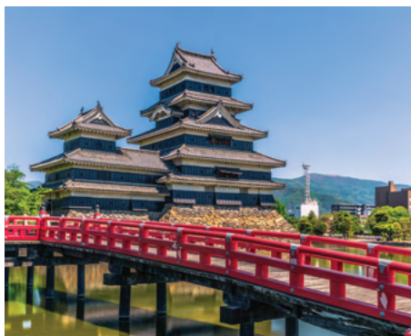
Matsumoto Castle, Nagano

Explore Sannomachi Street in Takayama's old town, engaging in a sake tasting session and visiting the Matsuri no Mori Museum, which exhibits the rich heritage of the Takayama Festival. Continue to Matsumoto to view the striking Matsumoto Castle, distinguished by its black exterior and nicknamed "Crow Castle." This historic site stands as one of Japan's most important castles and is the oldest existing five-structure/six-story castle in the country.