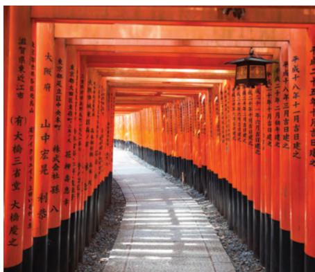
Fushimi Inari Shrine

Enjoy a day at your own pace, followed by a journey to the airport to catch a flight to Osaka. Once arrived, proceed with a transfer to your hotel in Kyoto.