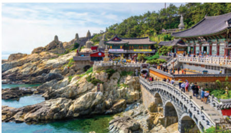
Haedong Yonggungsa Temple, Busan

Head to Busan and begin your exploration at Songdo Skywalk, a 365-meter promenade offering scenic views over the water from Songdo Beach. Next, visit the 120-meter-high Busan Tower, an emblematic symbol of the city. Explore Jagalchi Market, Korea's largest seafood market, bustling with vibrant stalls and fresh catches. Continue to Huinnyeoul Culture Village, set on Yeongdo's cliffs, offering quaint coastal charm. The journey culminates at Gamcheon Culture Village, known for its colorful houses and winding alleys, artistically set against the hillside.