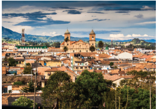
Zipaquirá, Bogotá.

Following breakfast, visit the spectacular Salt Cathedral of Zipaquirá, an engineering marvel constructed by miners deep within a salt mine. This awe-inspiring place of worship was built in honour of the Virgin of the Rosary of Guasá, protector of miners.