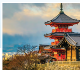
SOUTH KOREA AND JAPAN MAY 11 - 29, 2026