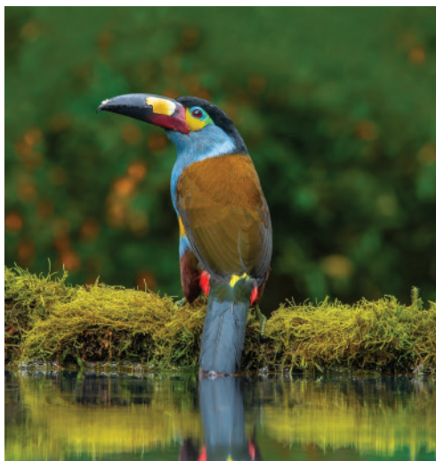
Magangué, Colombia.

Immerse yourself in the vibrant sights and untamed energy of Boca de Tacalao. Experience this legendary Colombian wonder on an intimate boat tour through the Magangué region. This nature tour offers a rare opportunity to encounter fascinating species, such as beautiful birds that are unique to this region of the country, making for an unforgettable immersion in wildlife. Then, enjoy a scenic cruise to the island town of Mompo, where you'll be greeted by local musicians for an exclusive jazz performance.