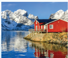
NORWAY AND LAPLAND MAY 8 - 23, 2026