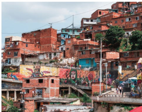
Comuna 13, Medellín.

Discover Medellín's remarkable urban transformation at Comuna 13. Stroll through the celebrated graffiti art district, savour a refreshing mango popsicle, and experience the innovative outdoor escalators that have revitalized this neighbourhood. A local guide will explain the significance of the art and the community's inspiring story. Enjoy lunch at a local restaurant. Later, visit a coffee farm within the city limits to learn about the bean-to-brew process behind Colombia's world-renowned coffee. Dinner at local restaurant featuring lively ambiance, live music, and fine cuisine.