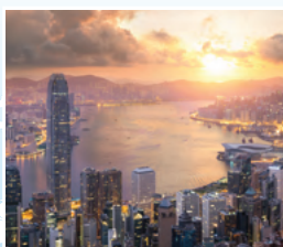
HONG KONG WINE AND DINE OCT 20 - 26, 2025