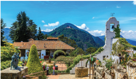
Mount Monserrate, Bogota.

Bid farewell to your ship and crew as you disembark and transfer to the airport for your flight to Bogotá. Upon arrival, you will transfer to your hotel for check-in. After settling in, enjoy lunch near Mount Monserrate. In the afternoon, visit the renowned Gold Museum and explore the charming Candelaria colonial neighbourhood. Return to the hotel for an evening at your leisure.