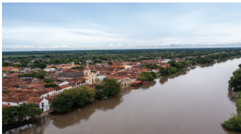
Magdalena River.

Bid farewell to Mompo and embark on a scenic cruise. Onboard, you'll be joined by local families from El Banco who are the keepers of La Cumbia. Experience this cultural treasure firsthand with authentic music, stories, and celebration right on the ship.