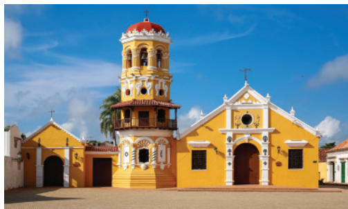
Santa Bárbara Church

Embark on a private boat to Santa Barbara de Pinto, a town on the banks of the Magdalena River. Choose your experience: an immersive town tour to learn traditional fishing net