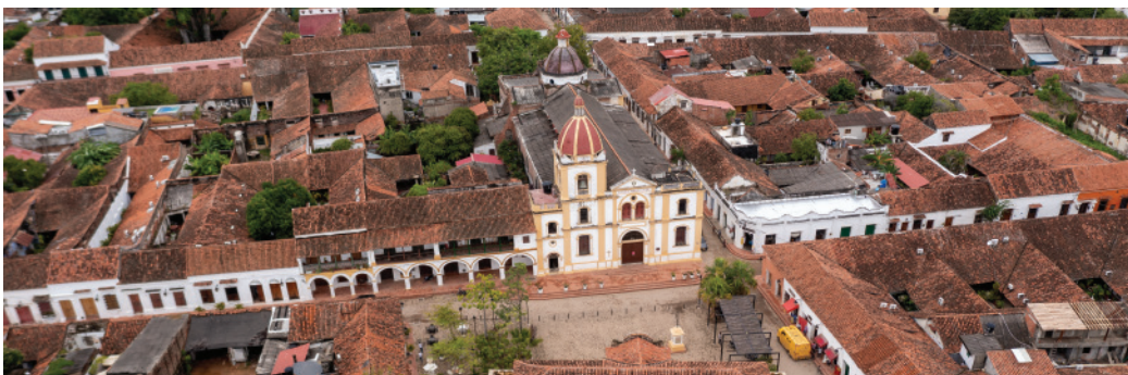
Mompox