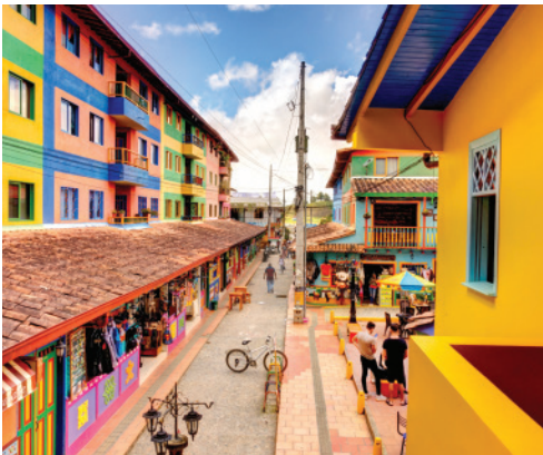
Guatapé, Medellín.

Today, we journey to the colourful town of Guatapé, located approximately two hours from Medellín. Marvel at the breathtaking landscapes before climbing El Peñol Rock, a striking 220-metre-high monolith with 740 steps to the top. Enjoy panoramic views as your reward. Following the climb, unwind with a short boat trip on the reservoir.