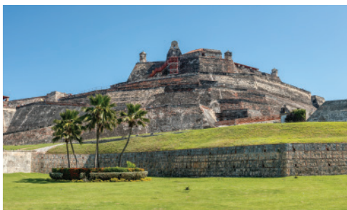
San Felipe Castle, Cartagena.

Visit the impressive San Felipe Castle, the "Old Shoes" monument, and the serene La Popa Monastery. After a short walk, enjoy your lunch. After lunch, explore the Walled City's colonial charm with its historic squares, colorful streets, and iconic landmarks. Enjoy a rum and chocolate tasting experience led by an expert, showcasing the harmonious pairing of these Colombian specialties.