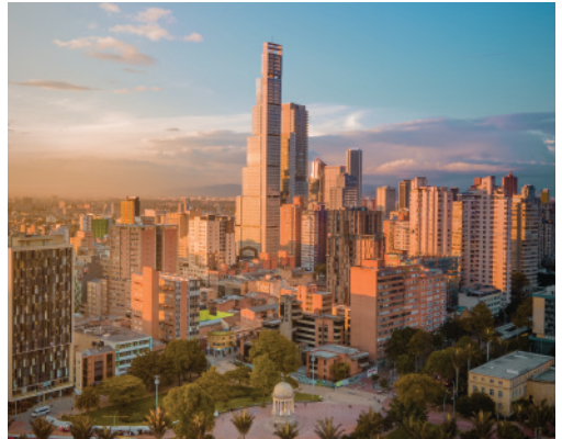
Centro de Bogotá.

Afterwards, enjoy lunch in Zipaquirá before continuing to the Guatavita Lagoon. This sacred place for indigenous people is home to the mythic El Dorado legend, where the chief swam in waters full of gold and precious stones. Farewell dinner at one of Bogotá's famous restaurants.