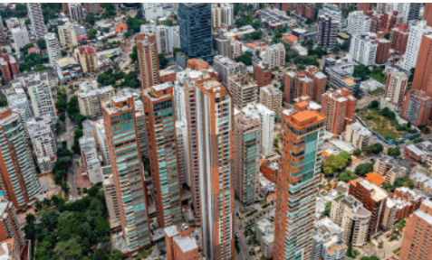
Barranquilla.

In the morning, visit a charming village on a guided tour that highlights the beauty and warmth of Colombia. Later in the day, venture to the beautiful seaside city of Barranquilla, a vibrant destination home to notable musicians, writers and artists. Immerse yourself in the warmth and culture of the city's atmosphere as you venture through this magnificent location, where you may see the bocas de cenizas, the point at which the magical Magdalena River meets the breathtaking Caribbean Sea. In the evening, enjoy an exclusive Carnaval celebration just for AmaWaterways guests as we bring the full traditional experience to our guests all year round.