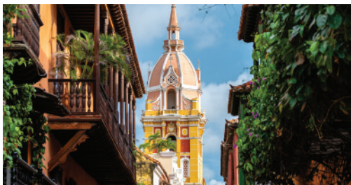
Cartagena, Colombia.

Accommodation: onboard AMA Melodia or similar (7 nights)