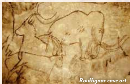
Rouffignac cave art

Rouffignac offers up-close views of over 250 deft prehistoric drawings and paintings that cover a gallery of cavernous walls and ceilings, including the famous friezes of two bison ready to engage each other in battle and 10 mammoths in procession — one of the largest cave paintings ever discovered. Near the village of Les Eyzies, visit the original Cro-Magnon rock shelter and UNESCO World Heritage site of L'Abri de Cap-Blanc, showcasing the rare, life-size frieze of horses and bison sculpted in limestone. An expert-guided tour of the National Museum of Prehistory in Les Eyzies helps put this vast network of prehistoric art into context as we contemplate life at the dawn of humankind.