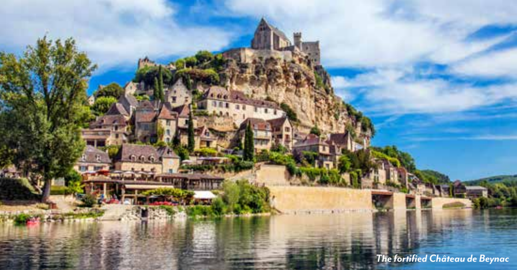
The fortified Château de Beynac