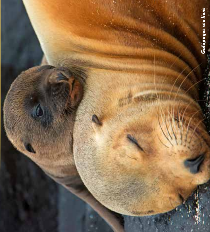
Galápagos sea lions

SPECIAL SAVINGS* AVAILABLE SAVE $2000 USD PER COUPLE!