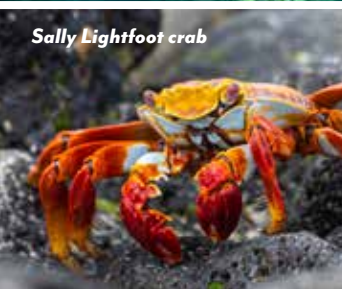
Sally Lightfoot crab