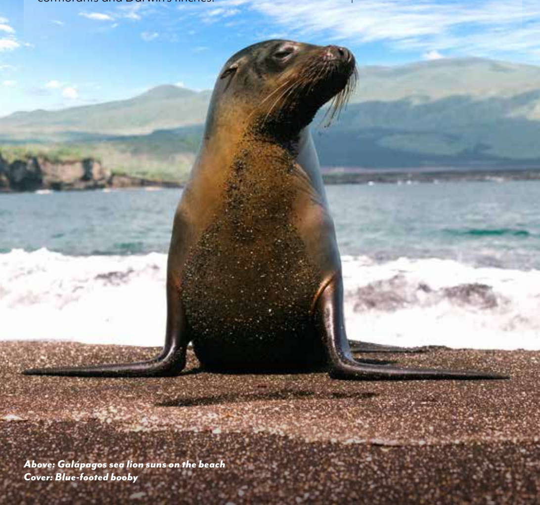
Above: Galápagos sea lion suns on the beach