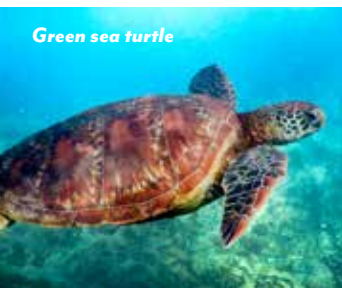
Green sea turtle