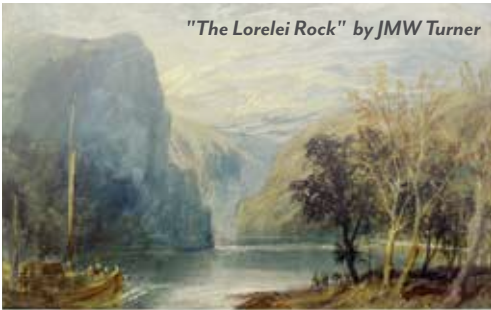
"The Lorelei Rock" by JMW Turner

English poet Lord Byron made the Rhine area enormously popular in 1818 with his narrative poem, "Childe Harold's Pilgrimage." German poets also penned verses as tribute to the area, including Heinrich Heine's famous "Die Lorelei," set at the river's Lorelei rock. English painter JMW Turner, among others, brought these beautiful river vistas to the canvas. And musical composers were likewise inspired. Franz Liszt famously set Heine's Lorelei poem to music, and Schuman's Symphony No. 3 was nicknamed the "Rhenish" symphony. Brahms' Symphony No. 3 leads with a Rhine theme, carrying on the tradition of Lorelei, the elusive siren of the river.