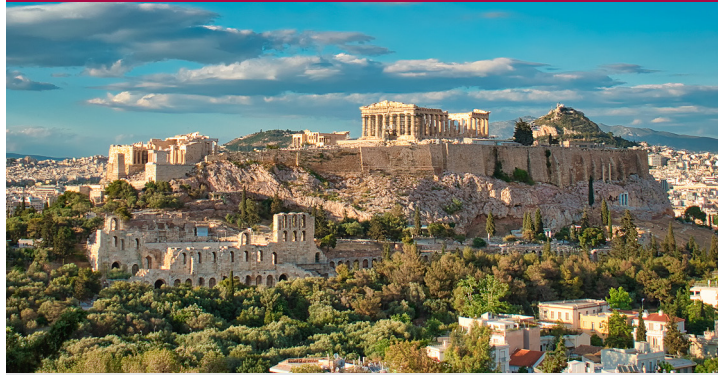
Athens | 4 days, 3 nights City Tour | Acropolis | Plaka