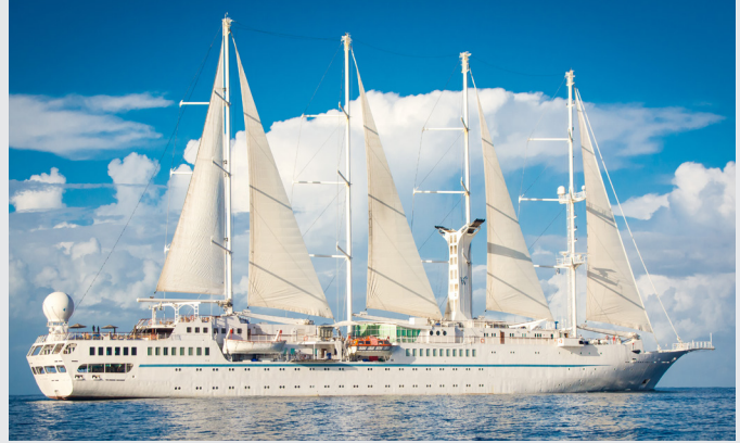
Wind Spirit Exclusively Chartered, Four-masted Sailing Yacht