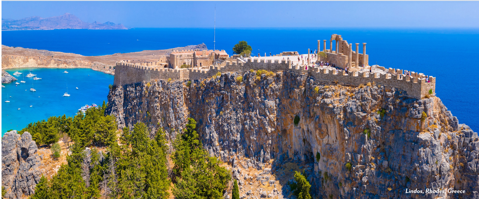
Lindos, Rhodes, Greece