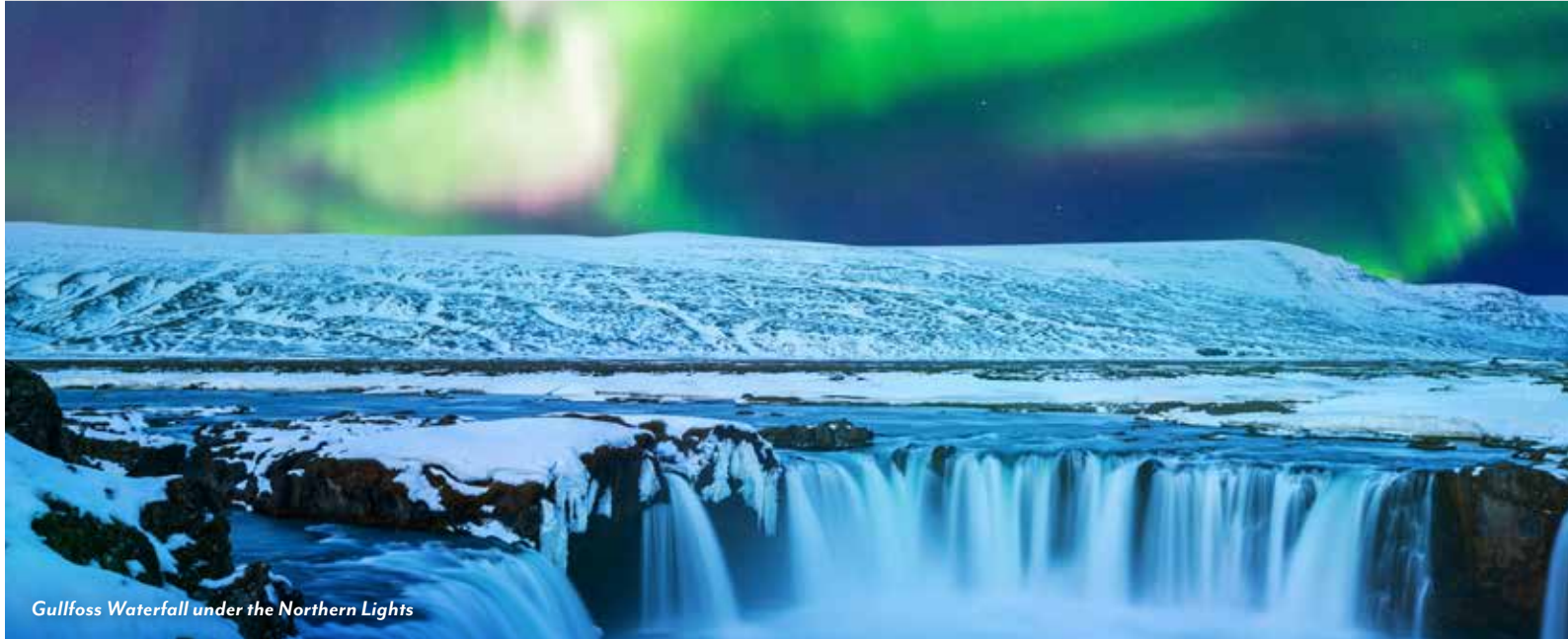
Gullfoss Waterfall under the Northern Lights