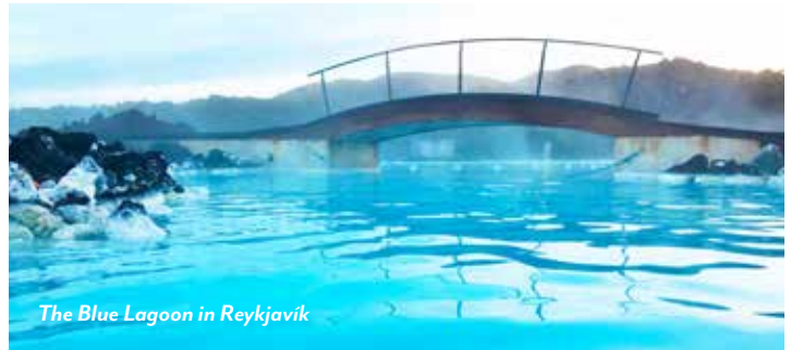
The Blue Lagoon in Reykjavik

Hótel Borg | Reykjavik Kea Hótel | Akureyri (pictured above)