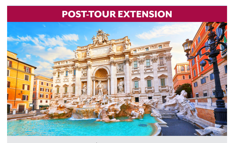
Rome | 3 days, 2 nights Borghese Gallery Tour | Rome Tour

Gohagan & Company 8550 West Bryn Mawr Avenue, Suite 650 Chicago, Illinois 60631