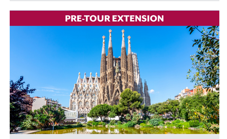
Barcelona | 4 days, 3 nights Barri Gothic & La Sagrada Familia | Tapas & Wine Lunch

Exclusively Chartered, Four-Masted Sailing Yacht