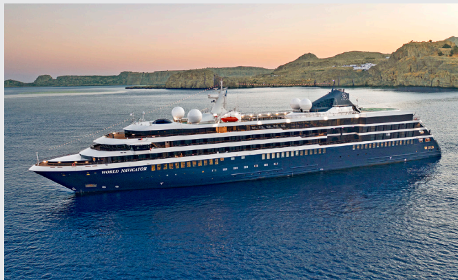
World Navigator Exclusively Chartered, Deluxe Small Ship