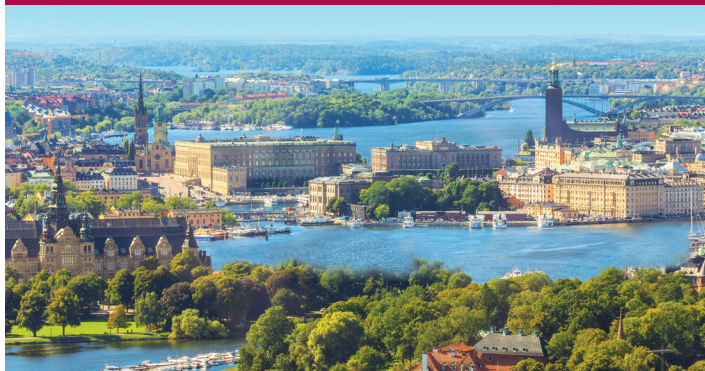
Stockholm | 4 days, 3 nights Old Town Tour | Vasa Museum