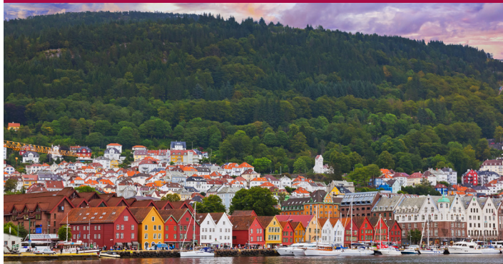
Norway | 5 days, 4 nights Historic Stalheim Hotel | Edvard Grieg Home | Flåm Railway

Gohagan & Company 8550 West Bryn Mawr Avenue Chicago, Illinois 60631