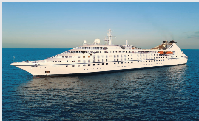
Star Breeze Deluxe Small Ship (Group Space)