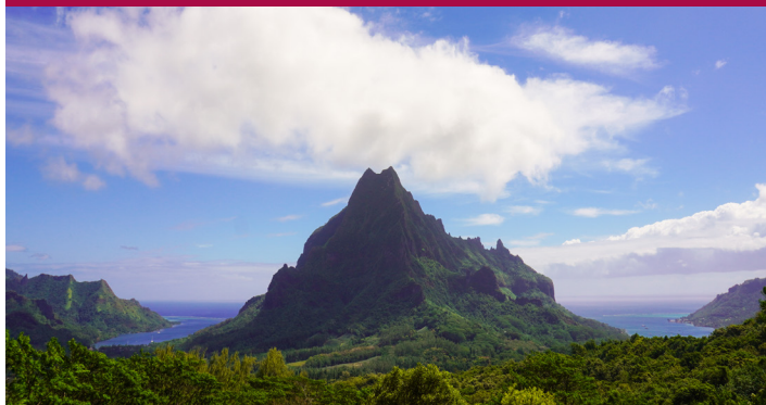
Mo'orea | 4 days, 3 nights Free time in Mo'orea | Included Ferry to Pape'ete