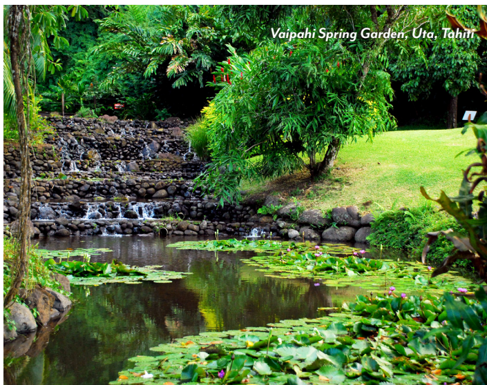
Vaipahi Spring Garden, Uta, Tahiti

Gohagan & Company 8550 West Bryn Mawr Avenue, Suite 650 Chicago, Illinois 60631