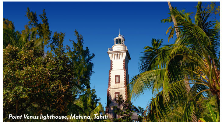
Point Venus lighthouse, Mahina, Tahiti