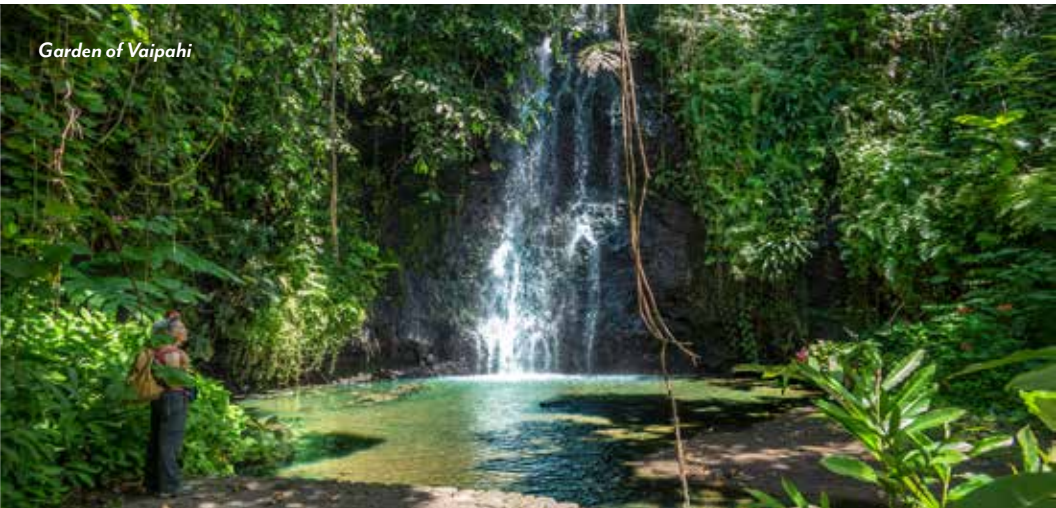
Garden of Vaipahi