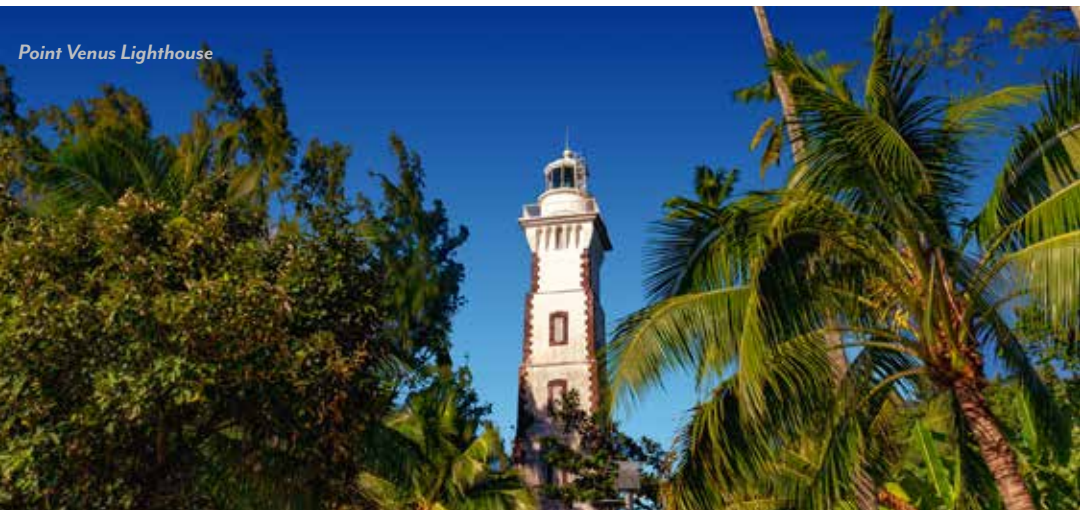
Point Venus Lighthouse

Today the ship arrives in Bora Bora, where you