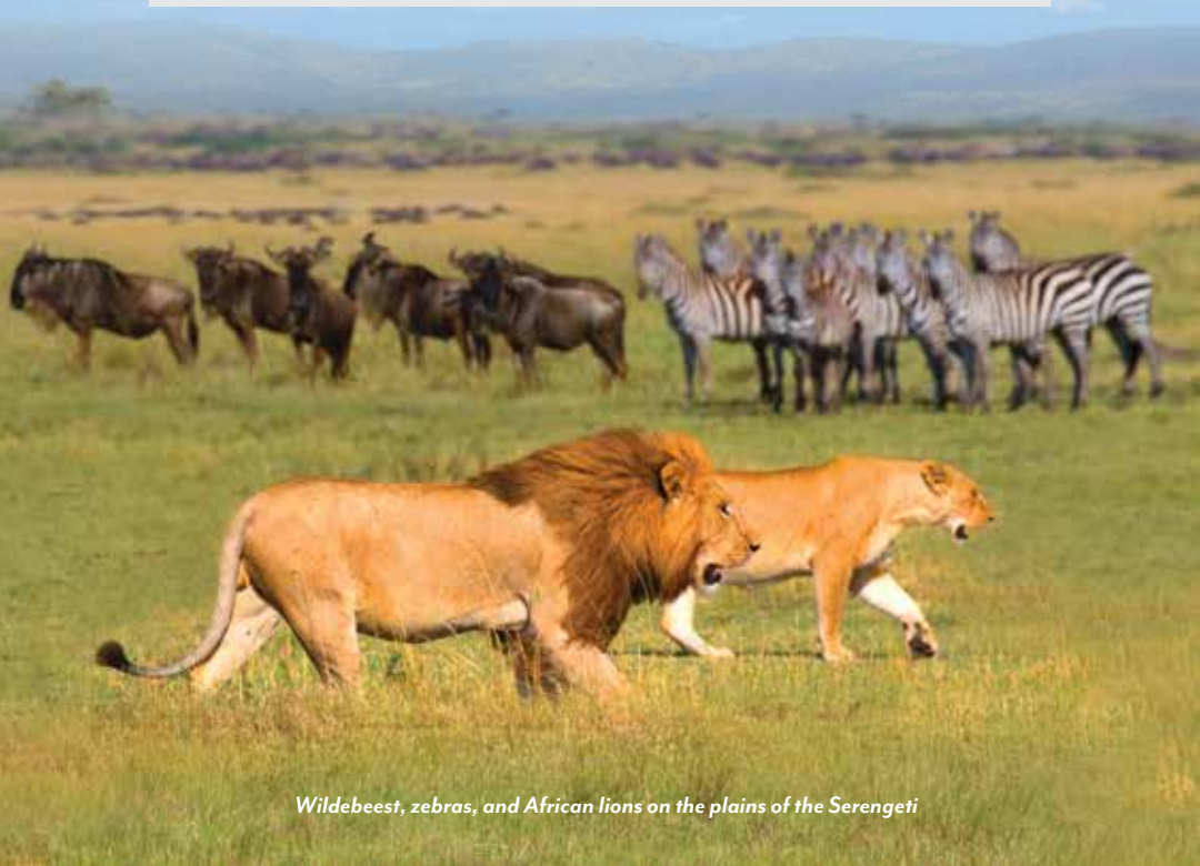
Wildebeest, zebras, and African lions on the plains of the Serengeti

When not on safari, visit a coffee plantation in Arusha, a Maasai village near Lake Manyara, a primary school on the edge of the Rift Valley, and Olduvai Gorge—a precious paleontological site often referred to as the “Cradle of Mankind.”