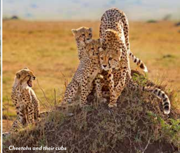
Cheetahs and their cubs