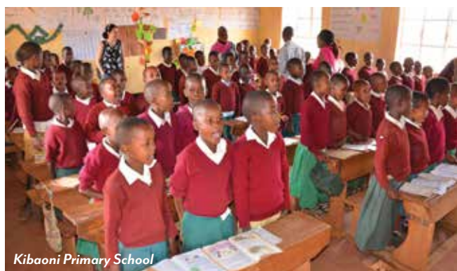
Kibaoni Primary School