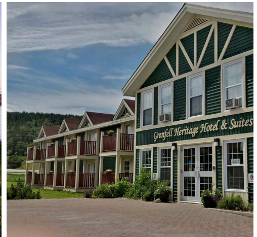
Grenfell Heritage Hotel & Suites