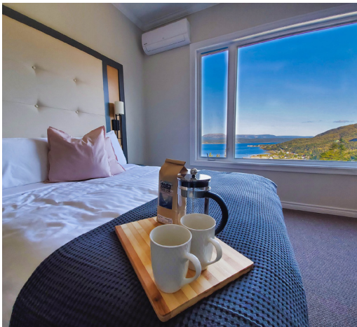
Gros Morne Inn

Deer Lake Motel is a Four Star Canada Select property with modern, comfortable rooms conveniently located close to the Deer Lake Airport. It offers a fitness rooms on-site. WIFI is available.