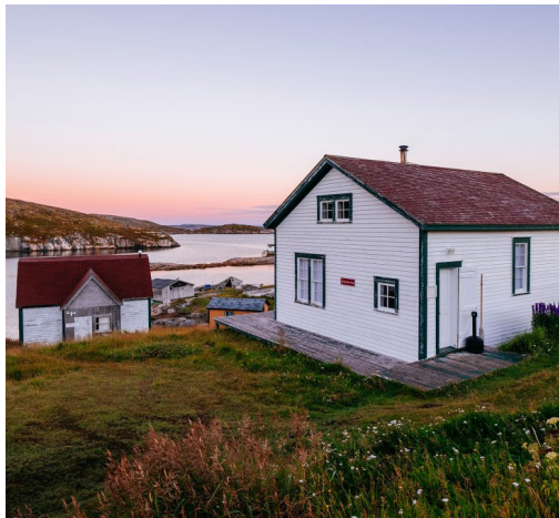
Battle Harbour Heritage Properties