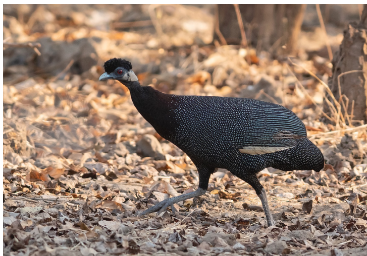
Crested Guinea fowl