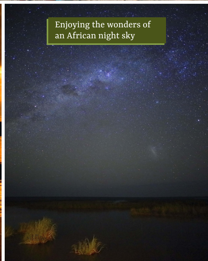
Enjoying the wonders of an African night sky