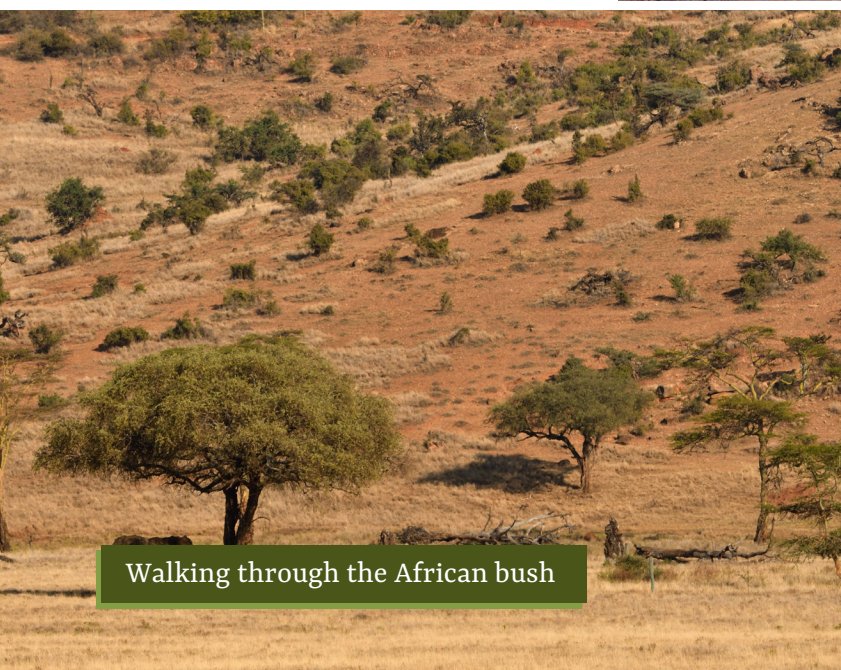
Walking through the African bush