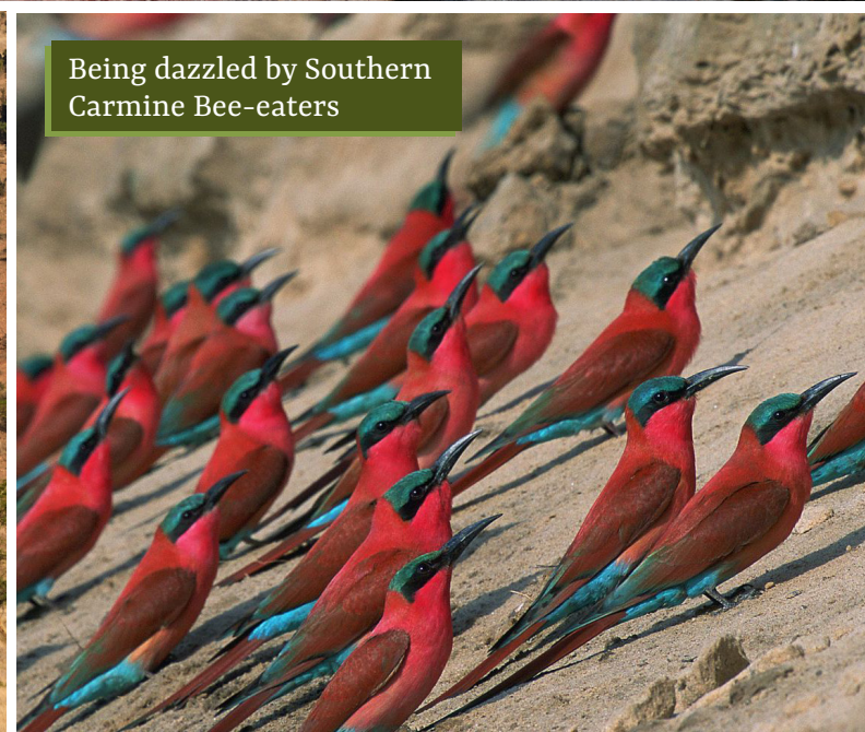
Being dazzled by Southern Carmine Bee-eaters