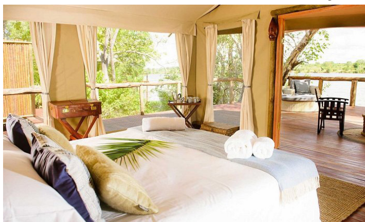
Ila Safari Lodge room