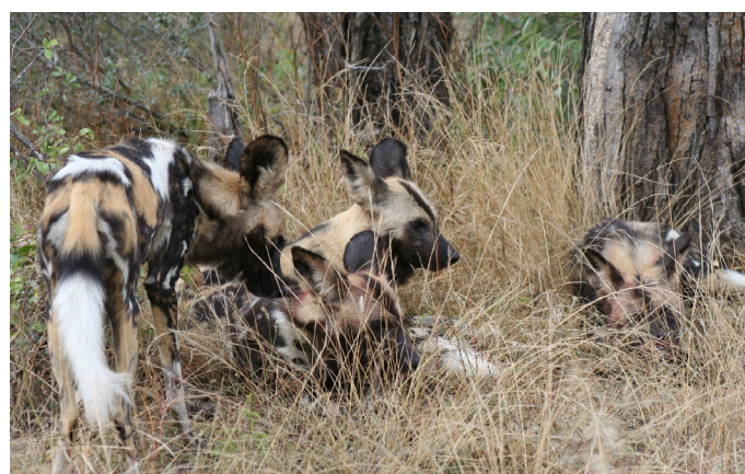
African Wild Dogs