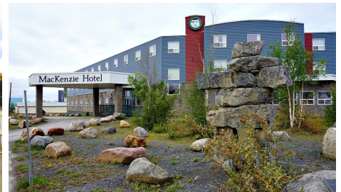
Mackenzie Hotel, Inuvik