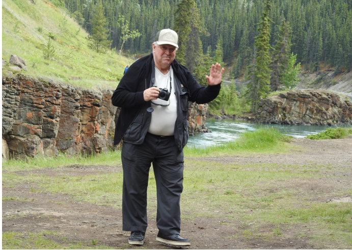
Quest traveller at Miles Canyon