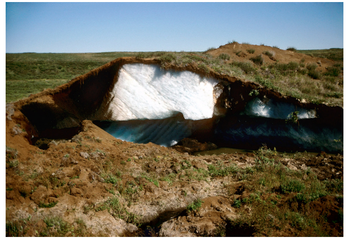
Detail of pingo in the Mackenzie Delta (near Tuktoyaktuk)

Meals: Breakfast, Lunch, Farewell Dinner