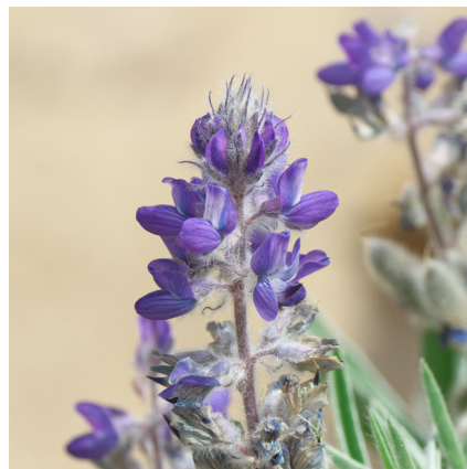
Yukon Lupine