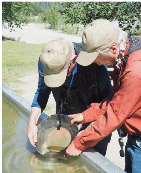
Quest traveller panning for gold