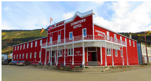
Downtown Hotel, Dawson City

We will be staying in motel/hotel accommodations throughout the tour. All are very clean and comfortable and are among the best available in the area.