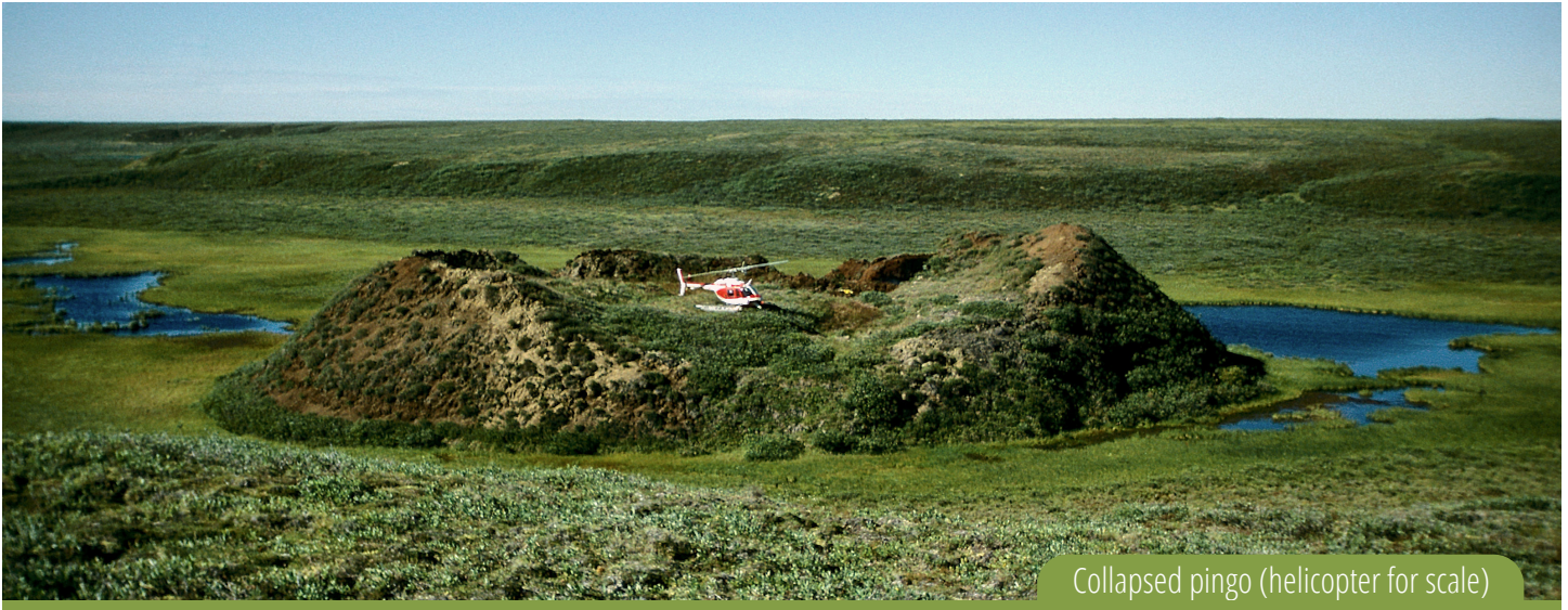
Collapsed pingo (helicopter for scale)