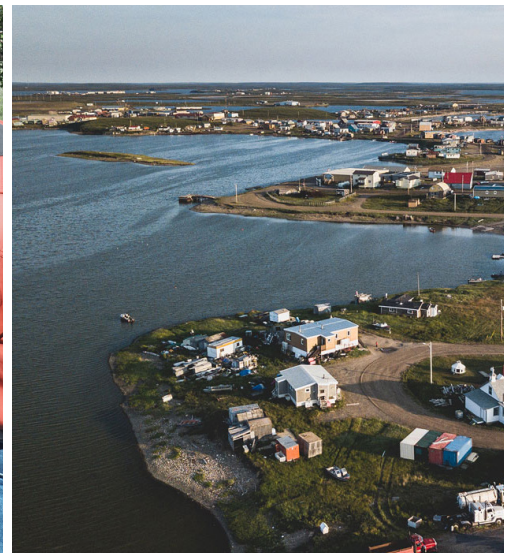
Tuktoyaktuk © Matt Trappe