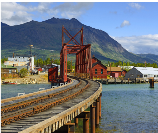
Iron Rail Bridge of Carcross

The itinerary and accommodation described in these notes are intended as an example only. In the event of weather changes, logistical arrangements, or other problems, we may make changes in the published itinerary.